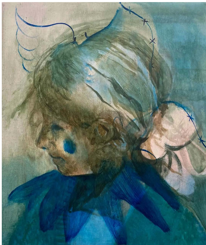
Alexis Soul Gray, A Crown of Thorns (Oil on linen, 35.5 x 30.5 cm, 2021)

Among works to be included are The Waves at Biarritz 2 , 2023, a painting of long-haired, athletic women on an abstracted semblance of seaside. It comes from a series of multi-media collages Soul-Gray constructed during the pandemic, then recreating them large-scale on canvas. Another key work is Guardians , 2023, which started as a memory painting of Soul-Gray's mother, who passed away when the artist was 25. Initially featuring a likeness of her mother, the surface was then bleached, rubbed and reworked over two years, moved from studio to studio until the work was completed with two delft-blue protective guardians, conjuring fairy tales of the past and giving the piece its name.