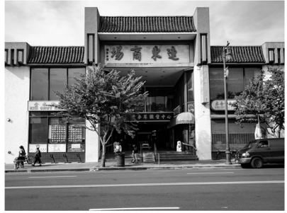
Far East Plaza in Chinatown.